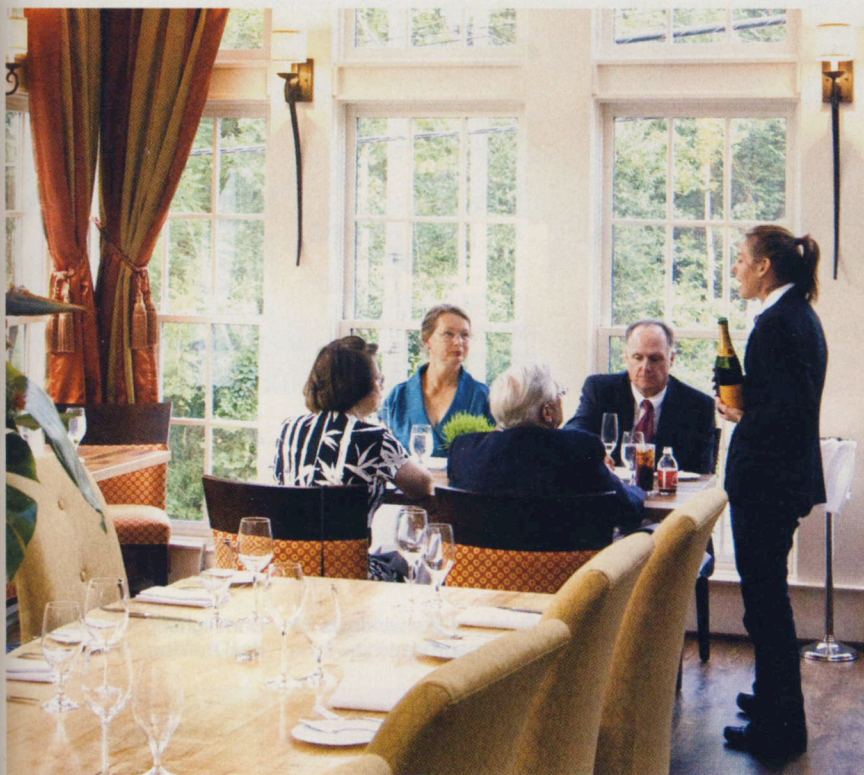
Trummer's on Main aspires to bring big-time dining to Clifton.

THE LATEST AND BEST IN FOOD, WINE, AND COOKING